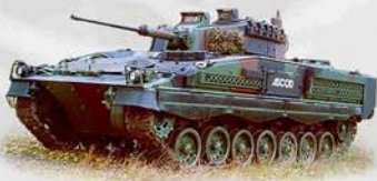
Vehicle Family ASCOD