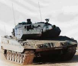
MBT LEOPARD 2 S122