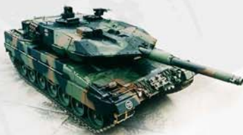
MBT LEOPARD 2A6