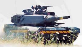
MBT M1 Abrams