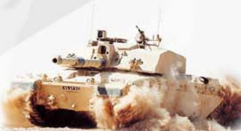
MBT DESERT CHALLENGER 2E