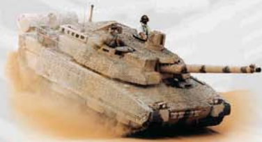
MBT LECLERC Tropicalisé